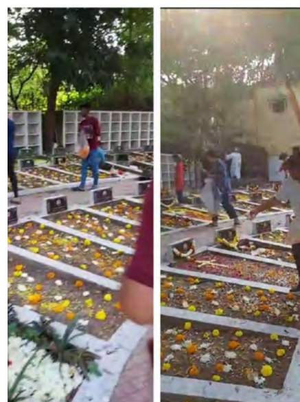
On All Souls Day, laying of flowers was done on unattended graves.