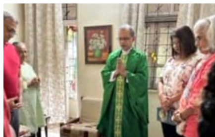
Mass for homebound celebrated in SCC