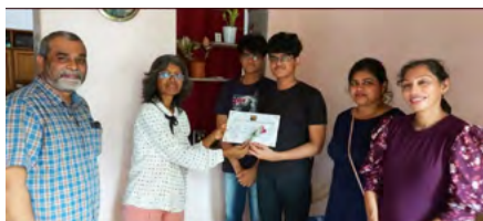
Wedding Anniversary Mass every last Sunday of the month by the Family Cell