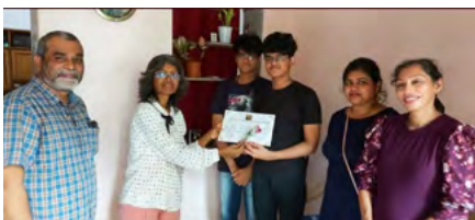
In the month of June, felicitated SSC & HSC students.