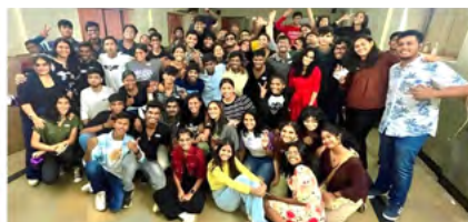
Youth Day celebrated in the parish.