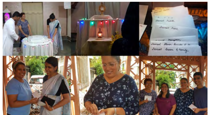
12 August: Zone 6 conducted a chain adoration for their community members at the Blessed sacrament chapel in the village. The 12 hour adoration from 9am to 9pm saw 27 families coming in every 30 minutes to meditate and worship before the blessed sacrament.