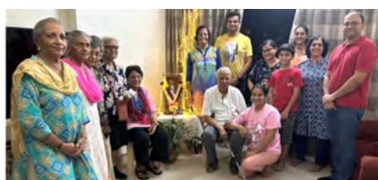
Nativity of Mother Mary & Girl Child Day