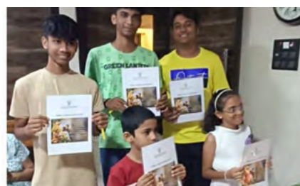
Rite of Presentation of the Lord's prayer was conducted in SCCs