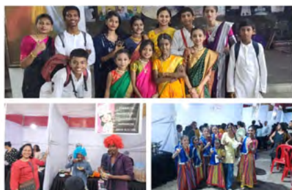
On Nov. 12, Children's Day was organised by 19 SCCs by organising food & games stalls; 83 children participated in folk dance.