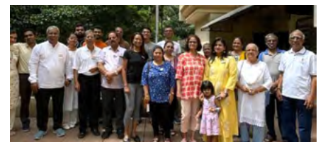
Independence Day celebration