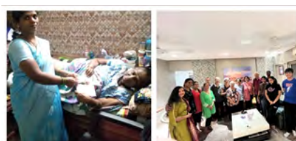
Visited grandparents & elderly with youth in 20 SCCs