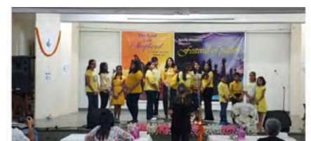
Sunday School celebrated Psalms Fest.