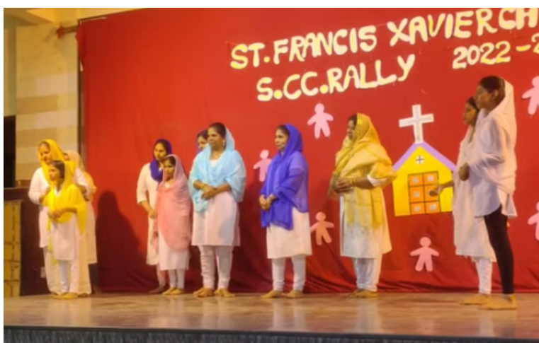
View snippets of the Parish SCC Rally 2023 by clicking on the picture

ST FRANCIS XAVIER CHURCH, KANJUR MARG EAST