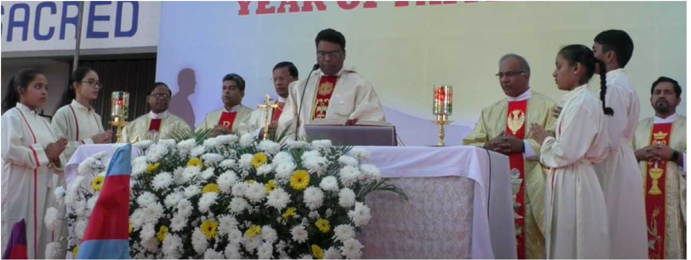
View and enjoy the proceedings of our Parish SCC Rally 2023 by clicking on the picture

The parishioners of Sacred Heart Church, Andheri, came together in prayer and festivity at the Parish SCC Rally celebrated on February 05, 2023 on the Parish grounds. The dictionary defines a Rally as “a mass meeting of people showing support for a cause.” In this instance, the Lay Faithful came together as one FAMILY in support of the Parish SCC Ministry.